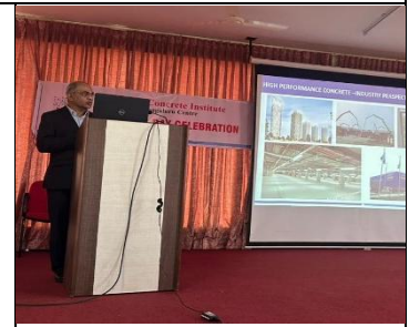
One day workshop on “Analysis and Design of RC Structural Element-23.11.2019