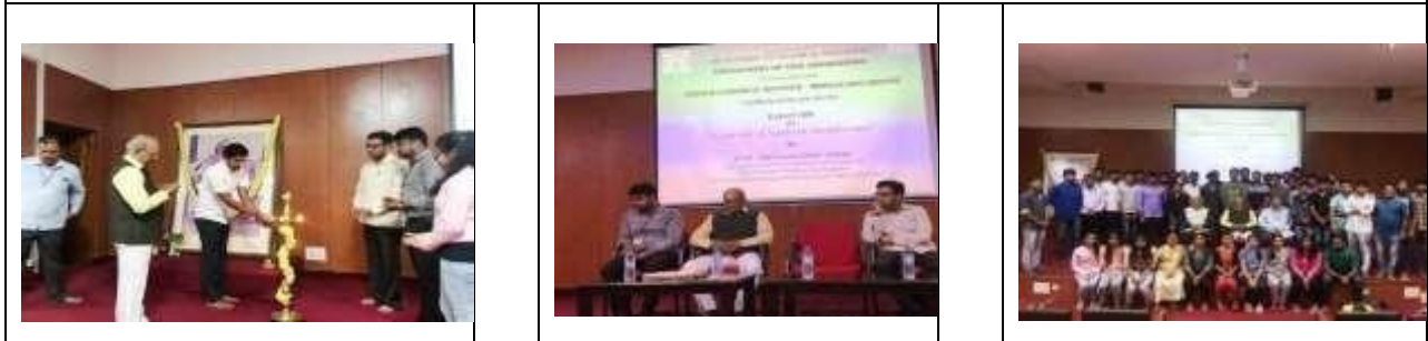
One day workshop on Urban Planning-19.11.2018