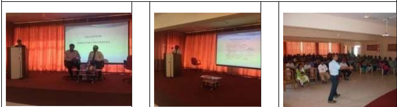
Two days hands on training program on bridge engineering-20.02.2018-21.02.2018