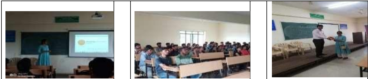
Expert talk on the topic "Concept of Vastu in Architecture"-23.11.2018