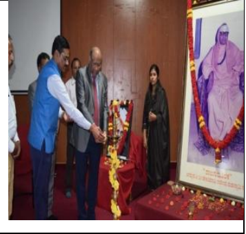
ICI Foundation Day Lecture in association with the Indian Concrete Institute (Student chapter), Bengaluru. on 07.09.2023